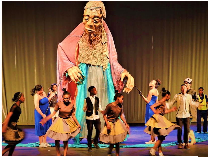
The River Redfin Show on stage at the Baxter Theatre