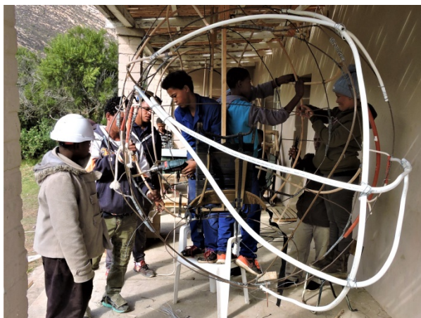
Project Hope building the fish puppet