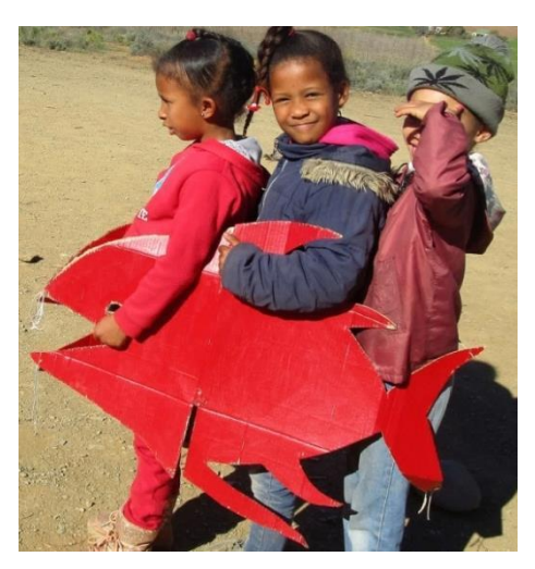
Vleiplaas girls present their Red Fin play