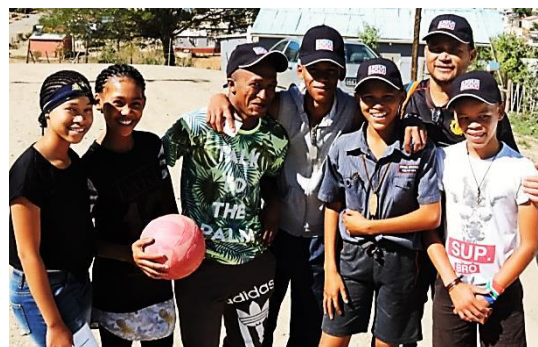
The Rooi Doppie cast off to perform