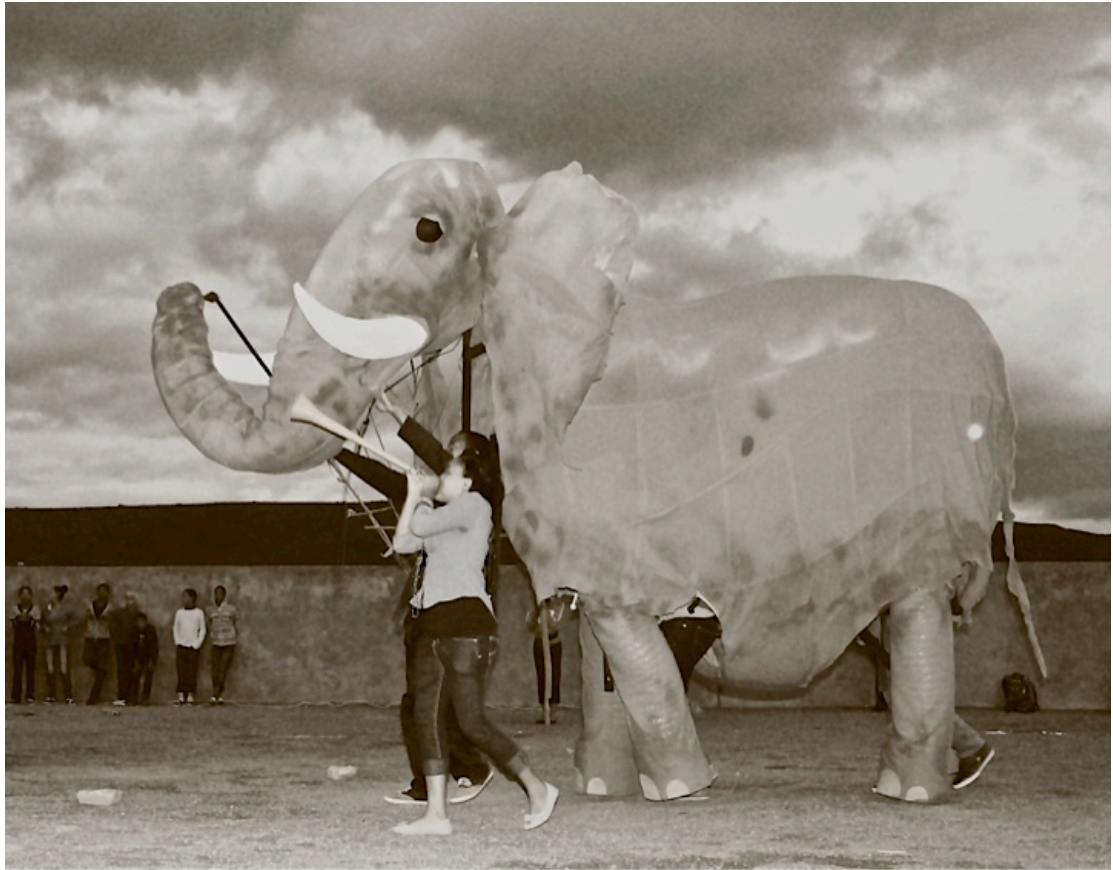
CHR, Handspring Trust, Net vir Pret, Magpie Art Collective Annual Parade, 15 December 2013, Barrydale