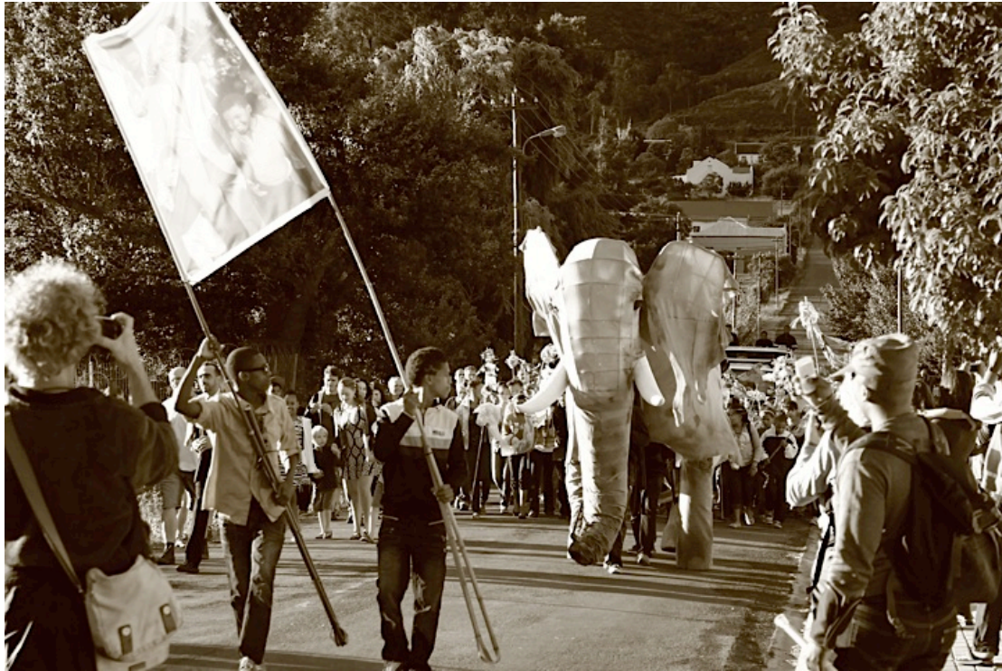
CHR, Handspring Trust, Net vir Pret, Magpie Art Collective Annual Parade, 15 December 2013, Barrydale