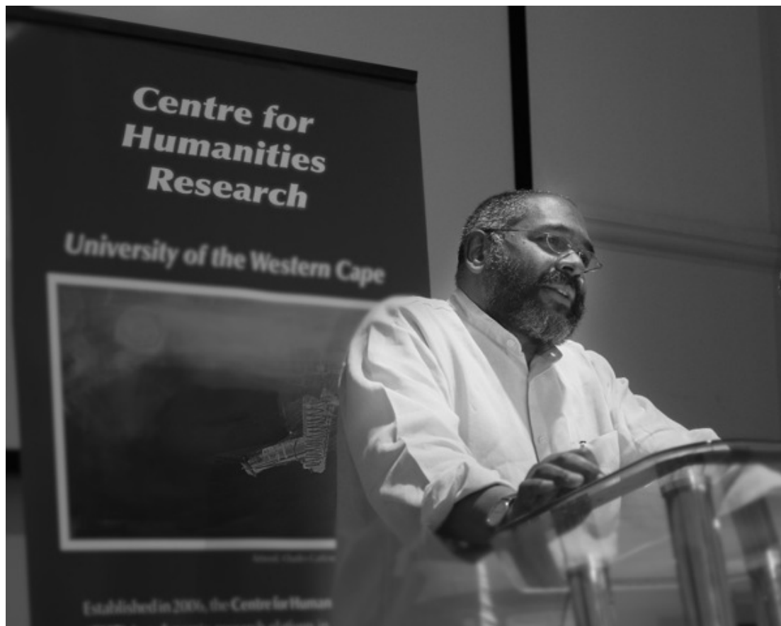
David Scott lecture on The Dialogue of Identity, 6 Spin Street